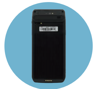
Autofocus rear camera with flashlight supporting 1D/2D barcode payments