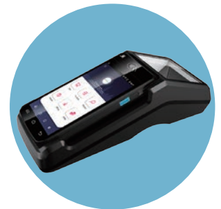
Charging, scanning window